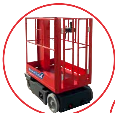
Compact & Powerful