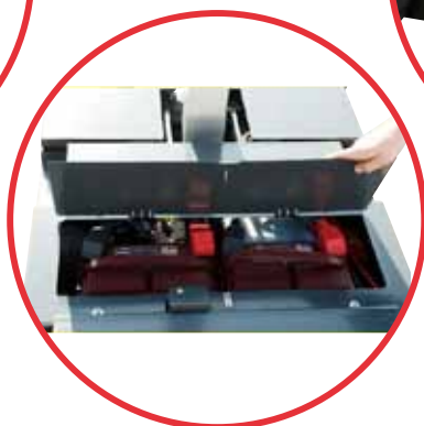
Integral fork pockets